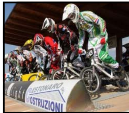
6th 2009 Euro Champs - Italy