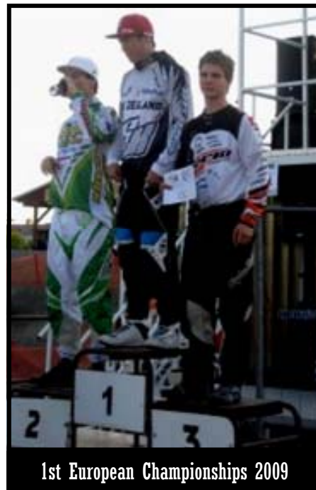
1st European Championships 2009